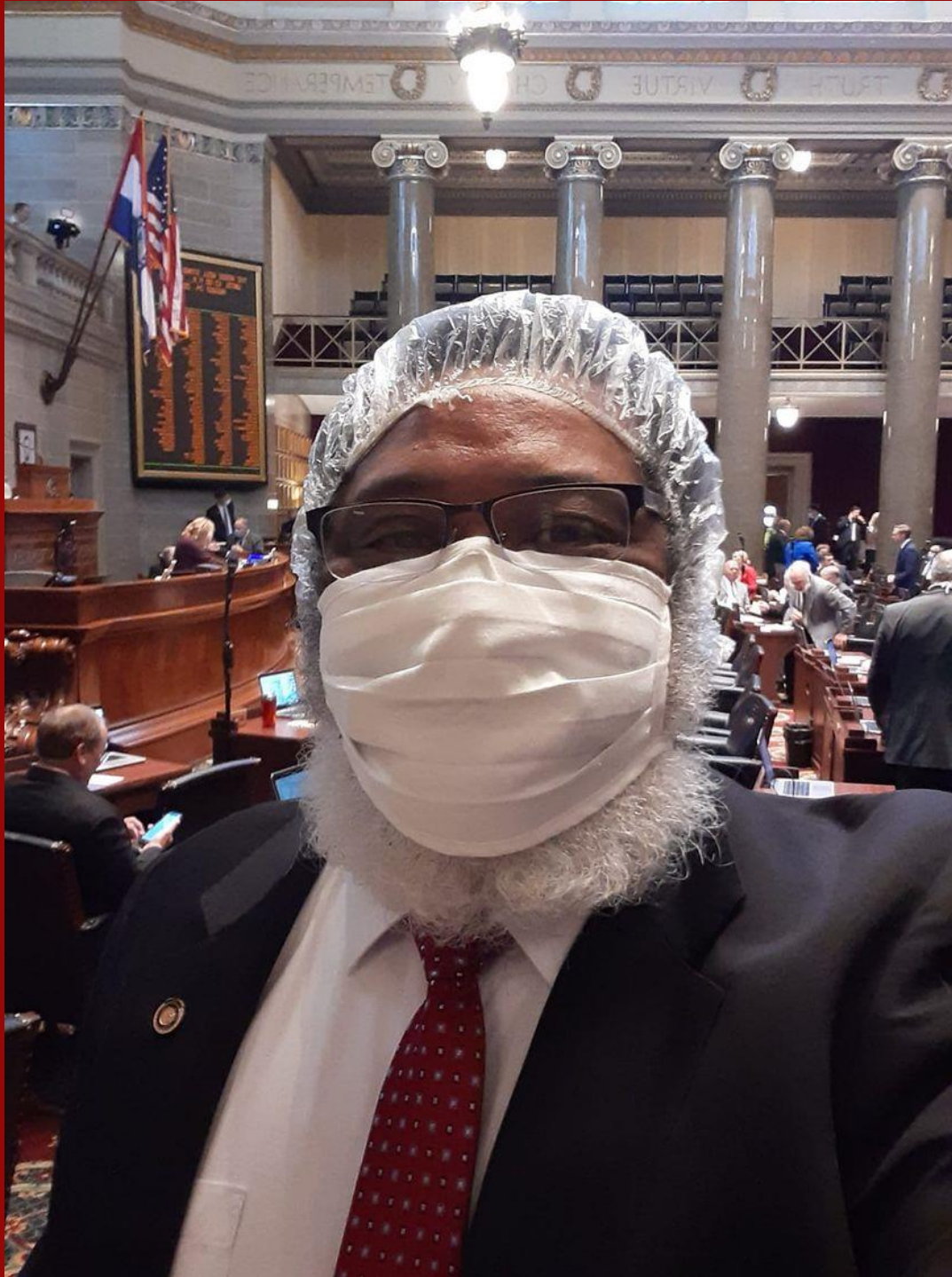
I was in full protective gear as the House returned for the Special Session to deal with Missouri Violence.