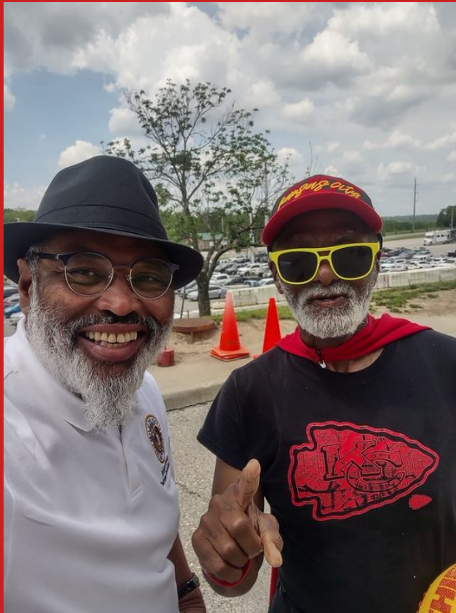
Summer is beginning, but this guy reminds all of us that football season is right around the corner. Go Chiefs!