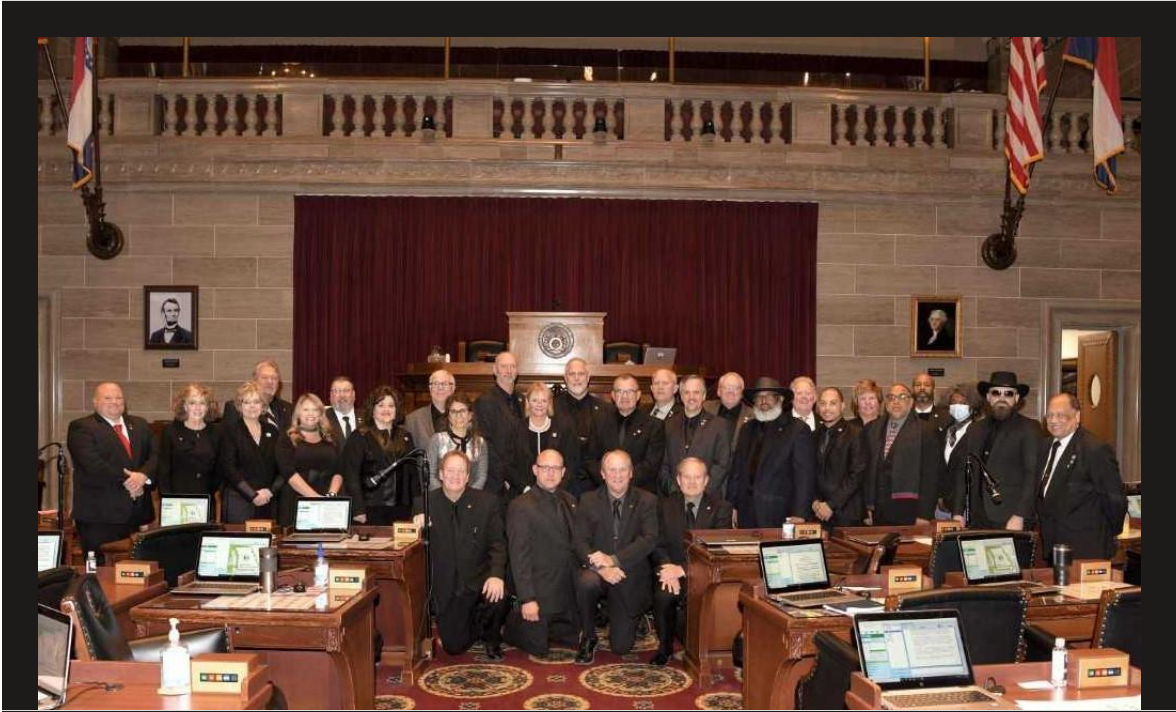
Several legislators including myself participated in the annual Johnny Cash Day at the Capitol by wearing black in his honor.