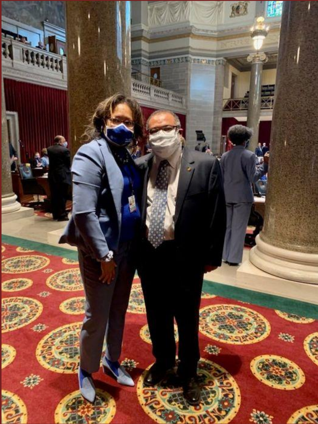
Sen. Barbara Ann Washington and I met to discuss improving the state rollout for the mass Covid-19 vaccine injections in Kansas City.