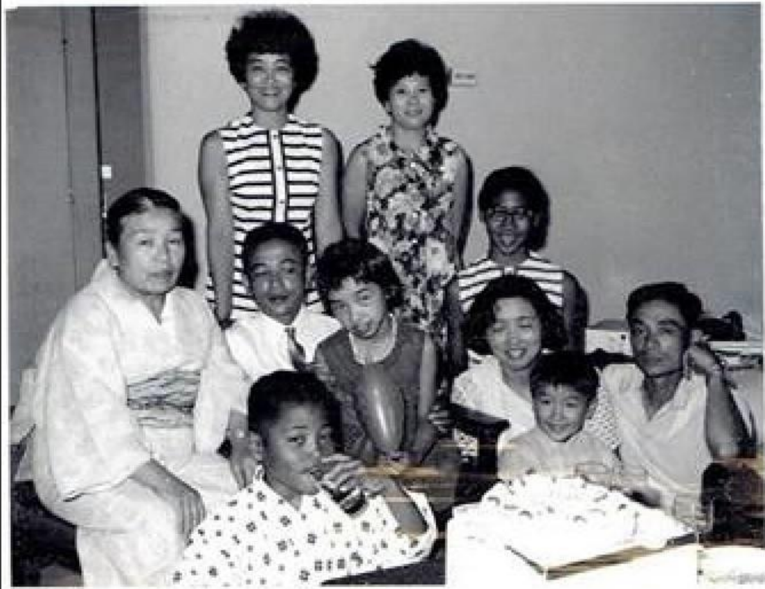
I too am Asian. This is a photo taken in 1968 with my mother's side of my family in Kobe, Japan. Can you pick me out?