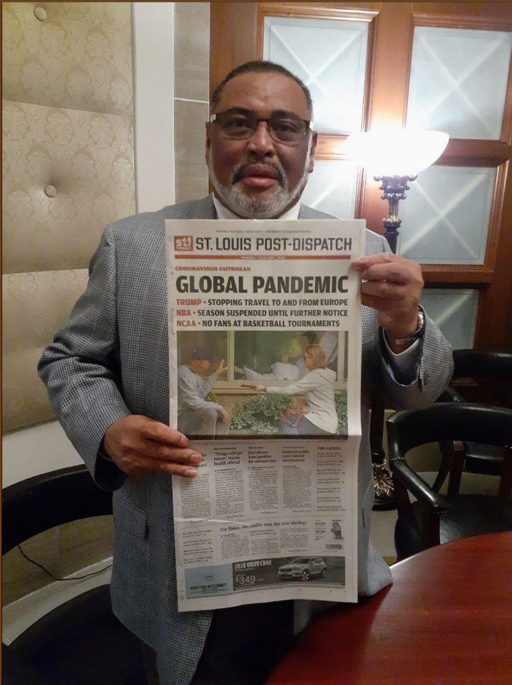
One year ago today, the World Health Organization declared the global COVID - 19 pandemic.