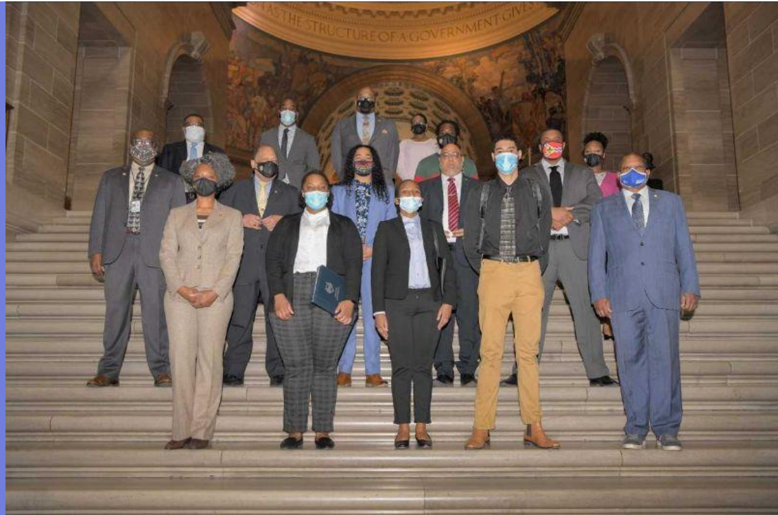
A group of Lincoln University students spent a day this week shadowing members of the Missouri Legislative Black Caucus.