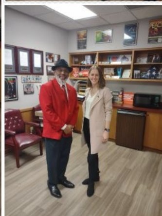
I met with Missourians from across the state this week to continue the good fight for healthcare, children and local communities.