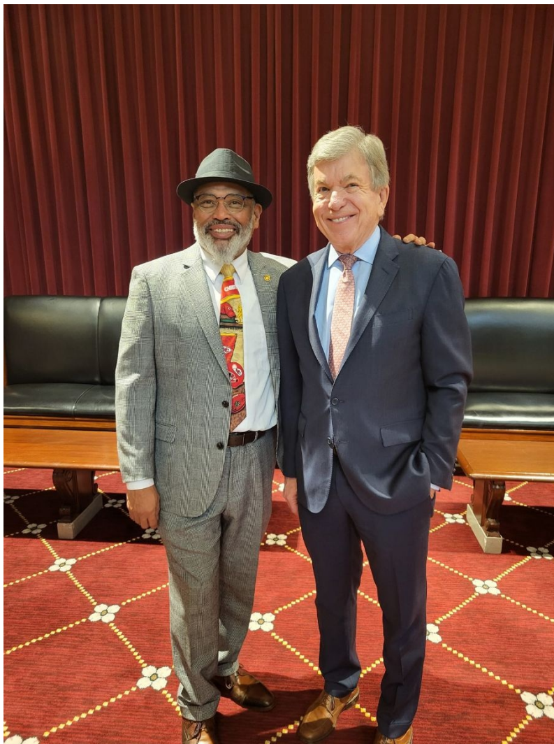
Former U.S. Senator Roy Blunt visited with me this week.