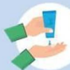
Clean your hands before removing the mask