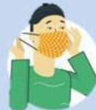
Remove the mask by the straps behind the ears or head