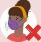
Do not use a mask that is difficult to breathe through