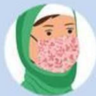
Adjust the mask to your face without leaving gaps on the sides

A face mask can protect others around you. To protect yourself and prevent the spread of COVID-19, remember to keep at least 6 feet distance from others, clean your hands frequently and thoroughly, and avoid touching your face and mask.