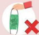
Do not use a mask that looks damaged