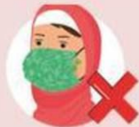
Do not wear a loose mask (tie a knot on straps if needed)