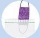
Remove the mask by the straps when taking it out of the bag