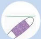
Store the mask in a clean plastic bag if it is not dirty or wet, and you plan to re-use it