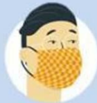
Cover your mouth, nose, and chin