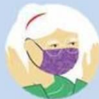
Avoid touching the mask