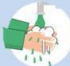
Wash the mask in soap or detergent, preferably with hot water, at least once a day