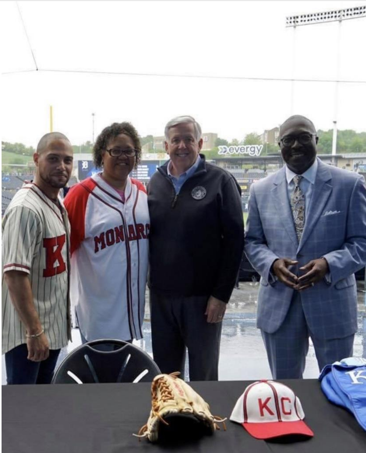
Missouri Governor Mike Parson conducted a ceremonial signing of legislation to establish a special Negro Leagues Baseball